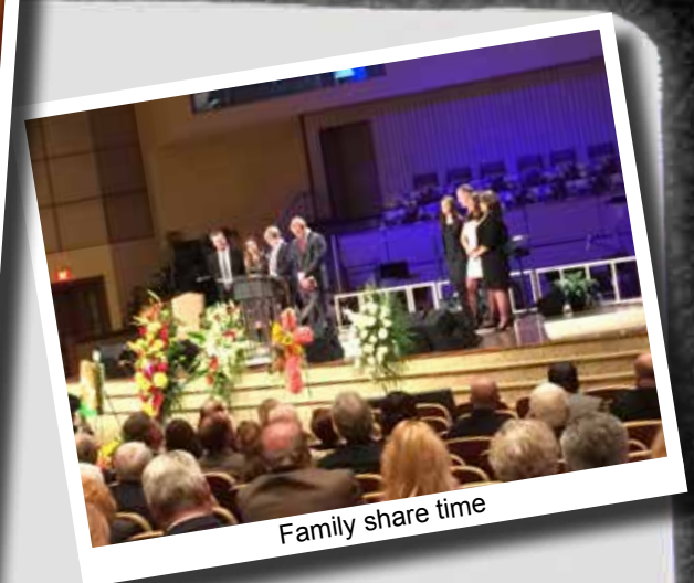
Family share time